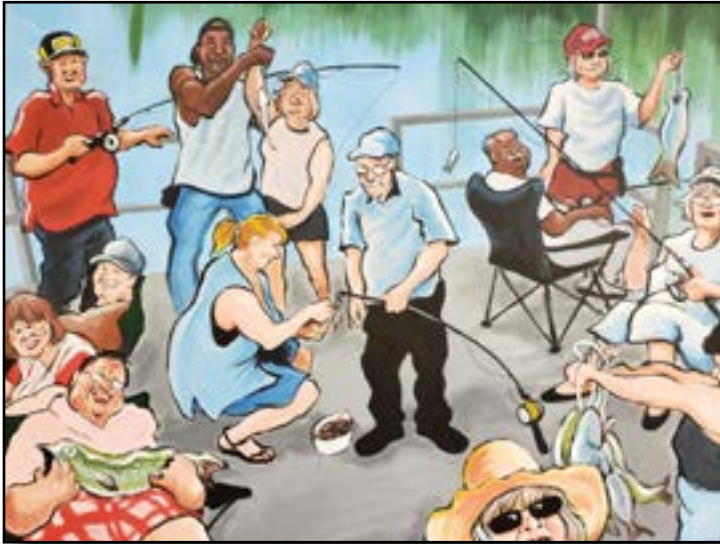
Senior Hot Shots Learning to Retire