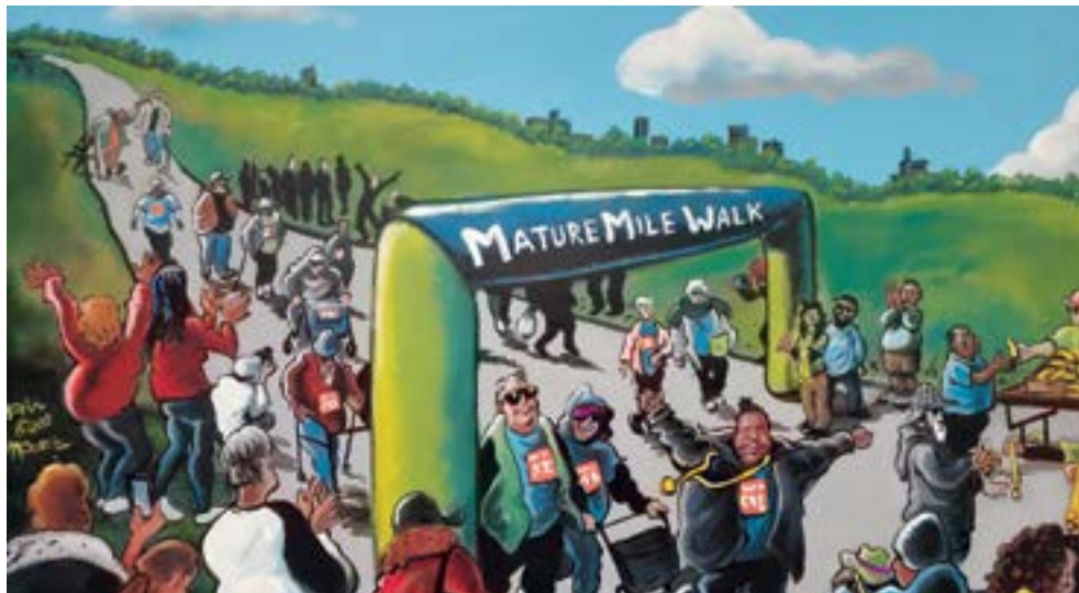
Mature Mile Walk