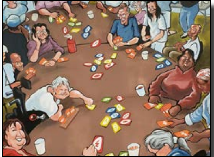
Senior Hot Shots with Friends