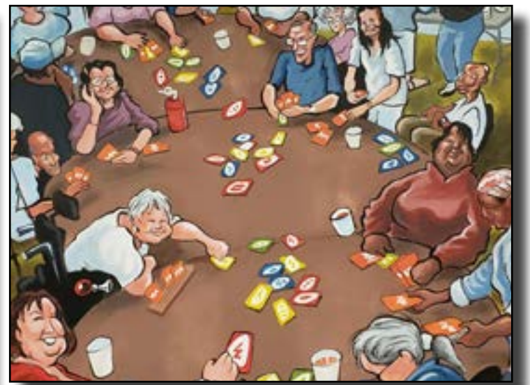
Senior Hot Shots with Friends